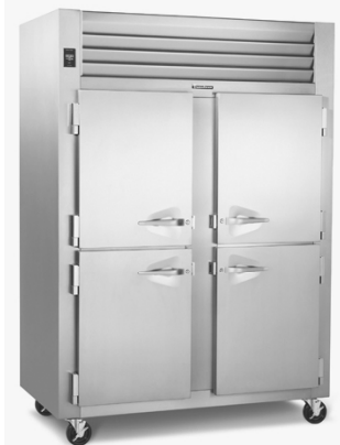
Model RHT232WUT-HHS (shown with optional casters)